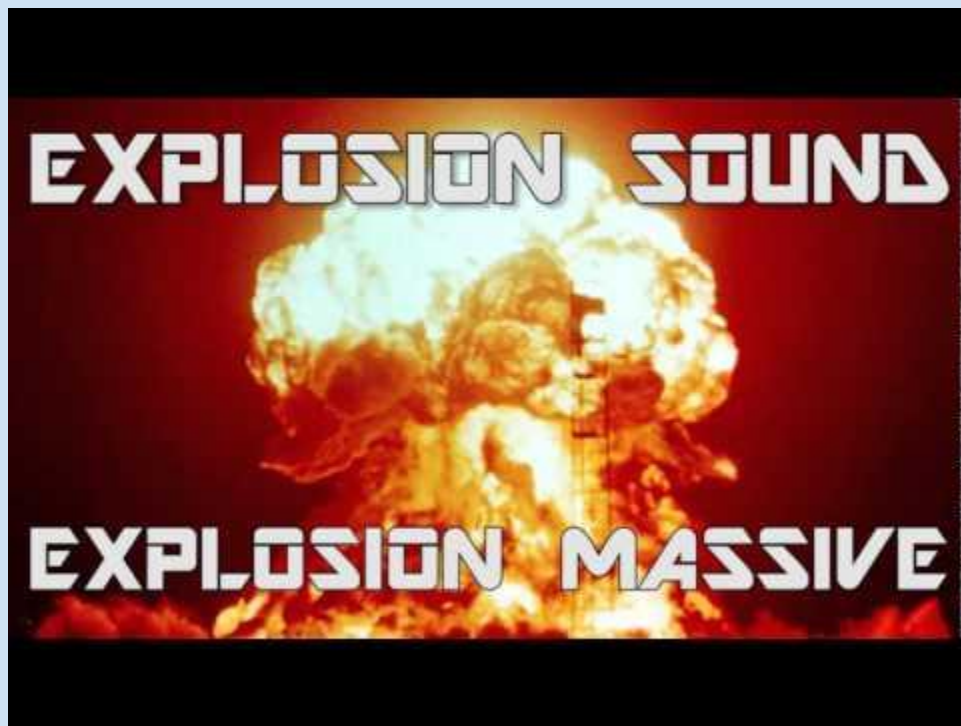
Still, YouTube user ROLENSFX